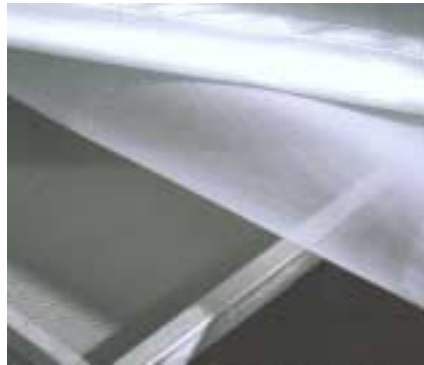
Example of application Esempio d'applicazione