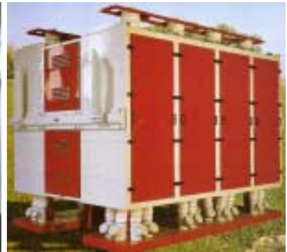
Sifter Buratto piano