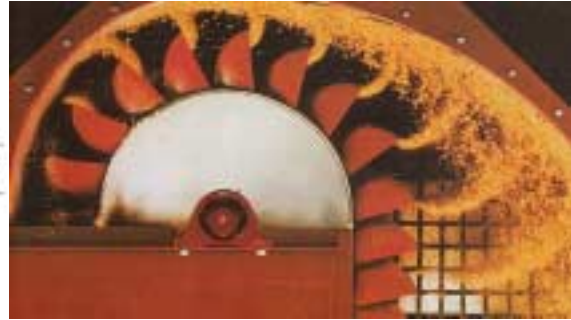
Application / Applicazione